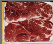
Fresh Cut Meats

Choose from our themed gift boxes or create your own special gift box by selecting from the numerous sausages